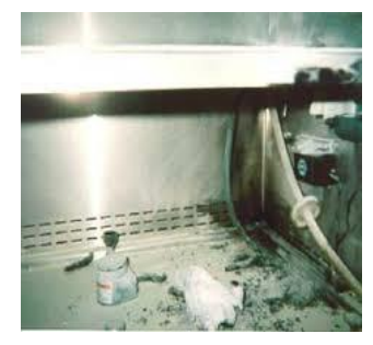
Figure 4. Fire caused by open flames in BSC

3. It may damage the HEPA filter or melt the adhesive holding the filter together, compromising the cabinet's protections. An open flame has the capacity to melt the bonding agent that holds the HEPA filter media to its frame. This destroys the HEPA filters' effectiveness at capturing aerosols and particles, leading to loss of sterility and containment.