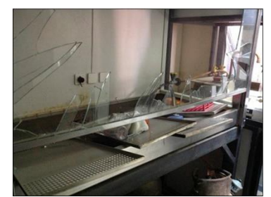
Figure 2. Glass shards remain in the sash frame after an explosion

2. It causes excessive heat build-up within the cabinet and can be a source of fires. Since Class II Type A2 cabinets, the most common type on campus, recirculates 70% of the air within the cabinet, heat from the Bunsen burner or open flame builds up over time. The excessive heat can inactivate or degrade research materials, thus affecting research results. In addition, concentrations of the flammable gas could reach explosive potential and pose a serious risk to not only the BSC, but to the user and the laboratory it occupies. Also, open flames within the cabinet can be a source of fire ignition for other materials within the cabinet, such as ethanol/alcohols and other easily flammable materials like paper towels.