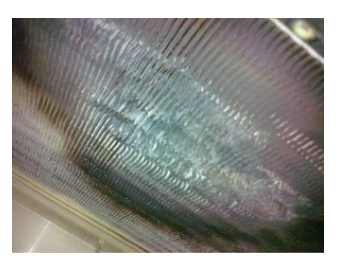
Figure 5. Damage to a HEPA filter caused by heat

3. It may damage the HEPA filter or melt the adhesive holding the filter together, compromising the cabinet's protections. An open flame has the capacity to melt the bonding agent that holds the HEPA filter media to its frame. This destroys the HEPA filters' effectiveness at capturing aerosols and particles, leading to loss of sterility and containment.