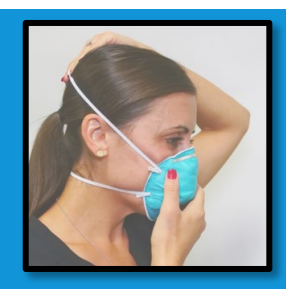
3. Pull the bottom strap over your head and place it around your neck, below your ears.