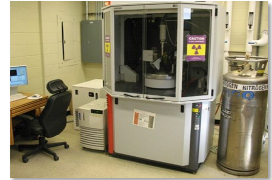
Radiation producing machine