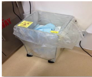
Radiation waste containers

If you see liquids spilled on the floor of a laboratory, do not clean them up. Notify someone in the laboratory of the spill. If no one from the laboratory is around, inform your supervisor.