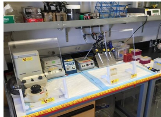
Radiation warning tape around the benchtop

Staff in these settings are trained and authorized to use these materials or machines. Their work is inspected closely for compliance with radiation control regulations by the Radiation Safety staff to assure that this work is being done safely. If your work requires you to touch or work in areas labeled as potentially contaminated with radioactivity, please contact Radiation Safety so they can confirm the area is free of radioactive contamination before you start work. If you have non-routine work to confirm (such as repairs, one-time requests, etc.) in rooms posted with radioactive signs, discuss your planned work activity first with the laboratory contact to confirm that it is safe to proceed. If in doubt, contact Radiation Safety for assistance.